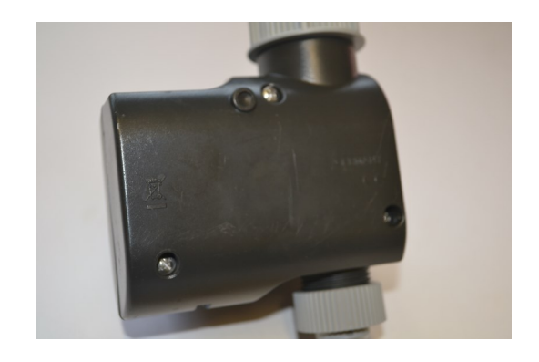
Old style remove 3 screws to remove back panel