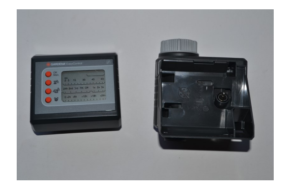
New style, remove front then release case by carefully releasing 4 plastic catches